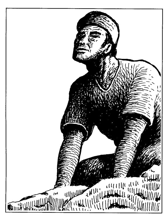
Elijah's servant watched intently from the top of Mt. Carmel for any sign of rain.

falling. Following Elijah's advice, he swiftly got into his chariot, and started out across the plains toward the town of Jezreel, about twenty miles distant.