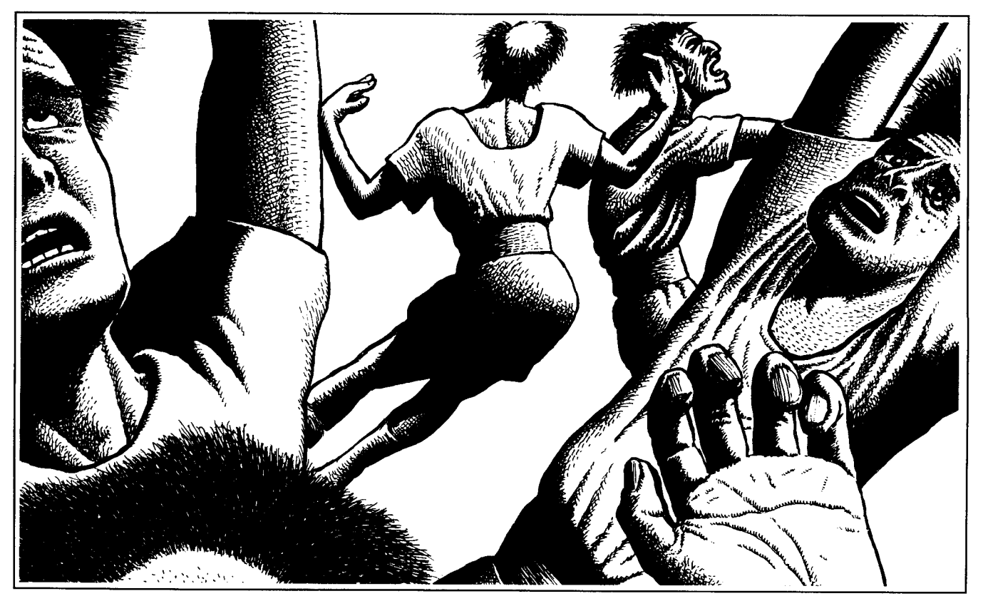
The prophets of Baal danced and sang wildly for hours, hoping their god would answer with fire.